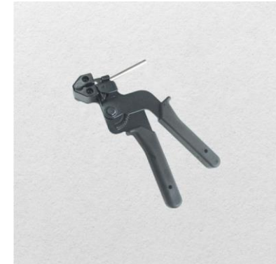
For easy installation use our cutting too - p/n SSTCT1